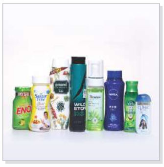
Note: Photographs Displayed in this brochure are market samples which have been used for circulating knowledge about our products. There is no intention to copy, infringe on the marketed product.